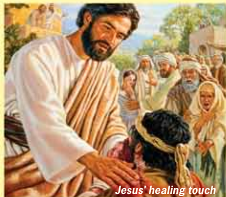
Jesus' healing touch